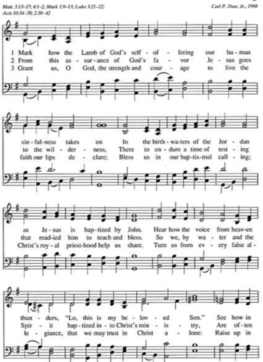
(Continued on next page)