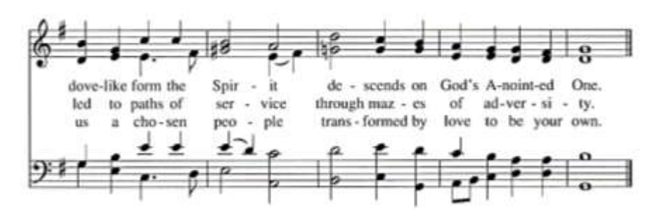
We Go Forth