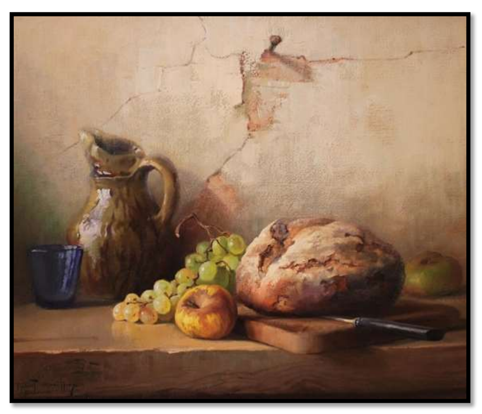
Still Life – loaf of bread with fruit and pitcher