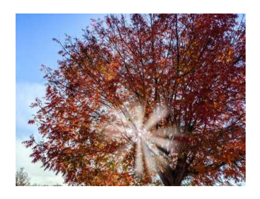
Twenty-First Sunday after Pentecost October 17, 2021