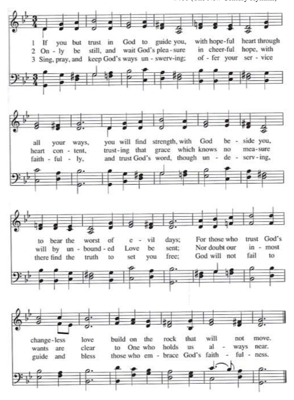
If You But Trust in God to Guide You #410 (The New Century Hymnal)