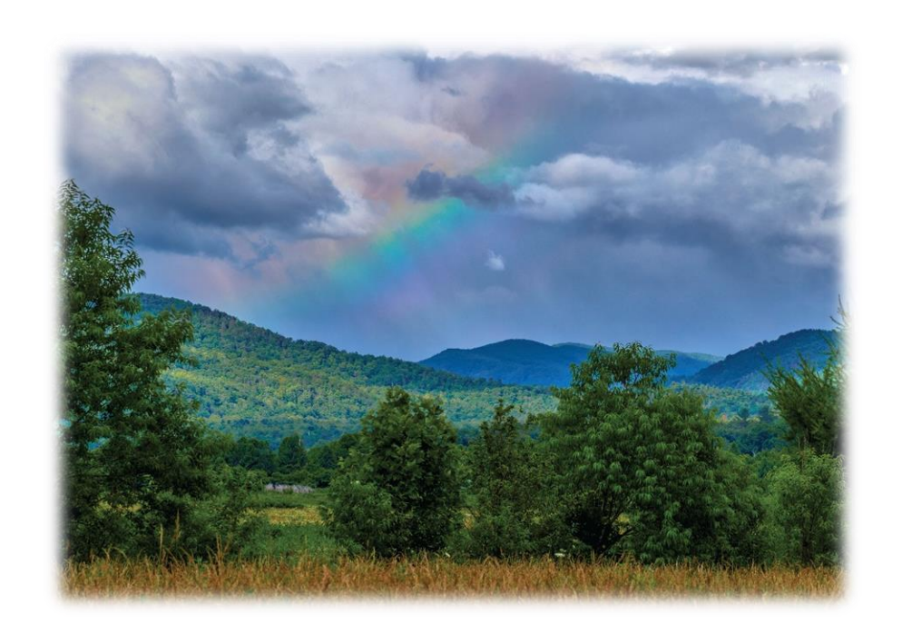
Twenty-Fifth Sunday after Pentecost November 14, 2021