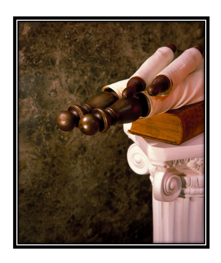
Third Sunday after Epiphany January 23, 2022