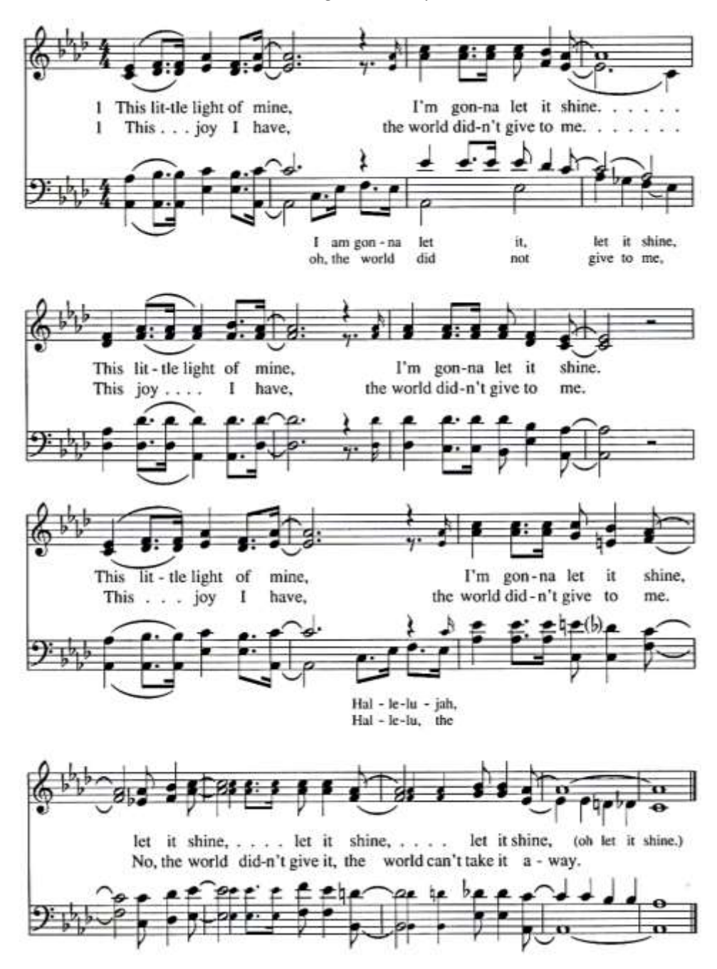
This Little Light/This Joy I Have