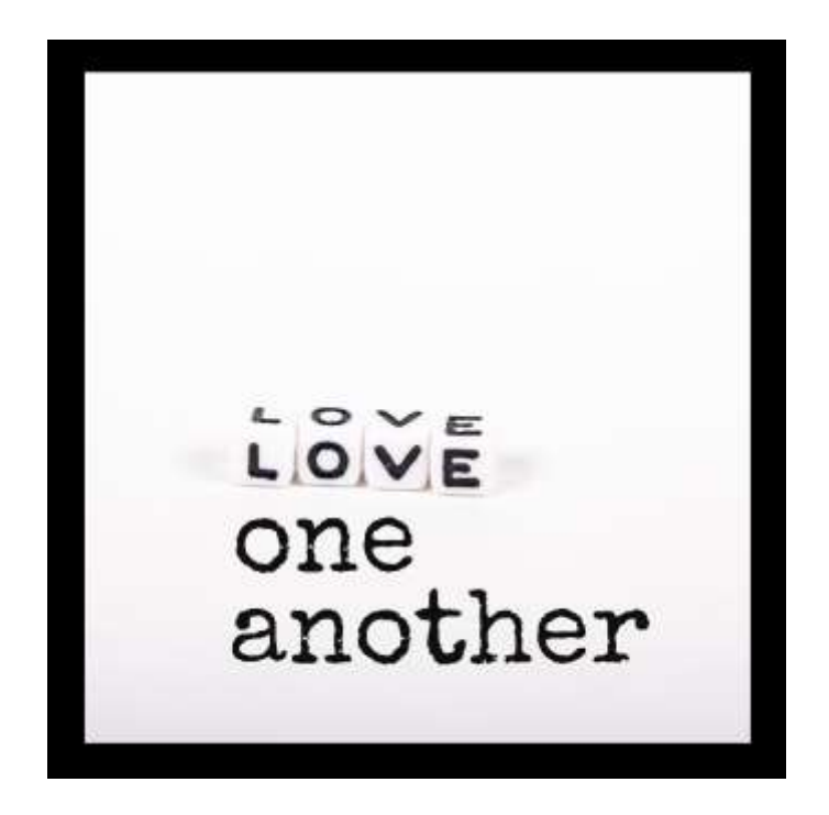
Fifth Sunday of Easter May 15, 2022