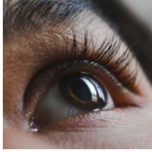
Zooming In! Ways to stay connected during this time of Sacred Distancing