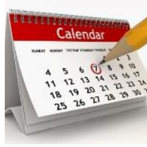
Meetings and Updates We are still being "Church" and meeting over Zoom